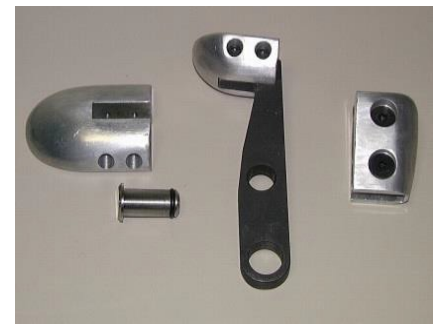
3055/2 for children size